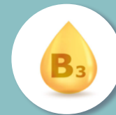
Niacinamide (Vitamin B3 or PP)