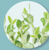
Soy bean germ and wheat germ