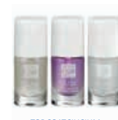
TOP COAT SILICIUM