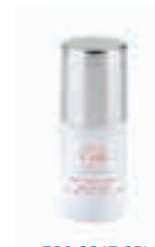
TOP COAT GEL + SILICIUM