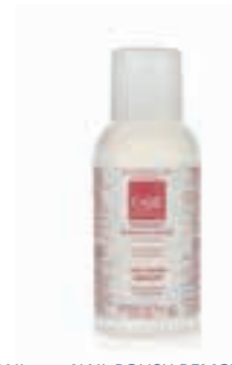
NAIL POLISH REMOVER ACETONE FREE