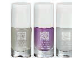
TOP COAT SILICIUM